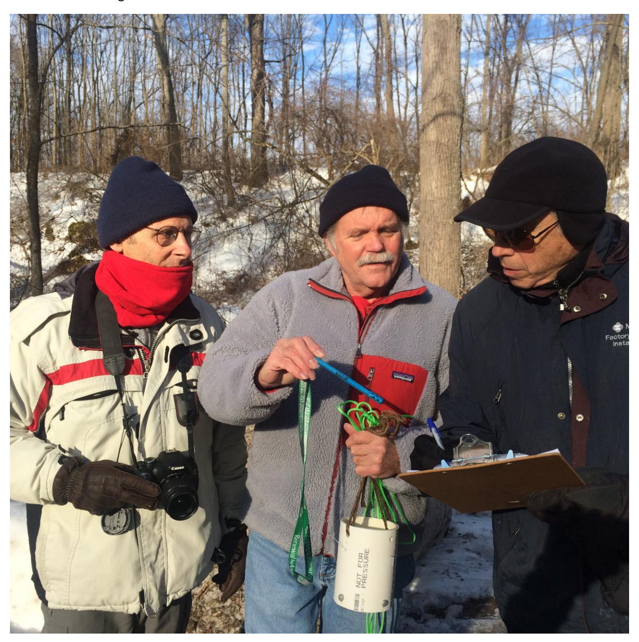
Mount Joy Team