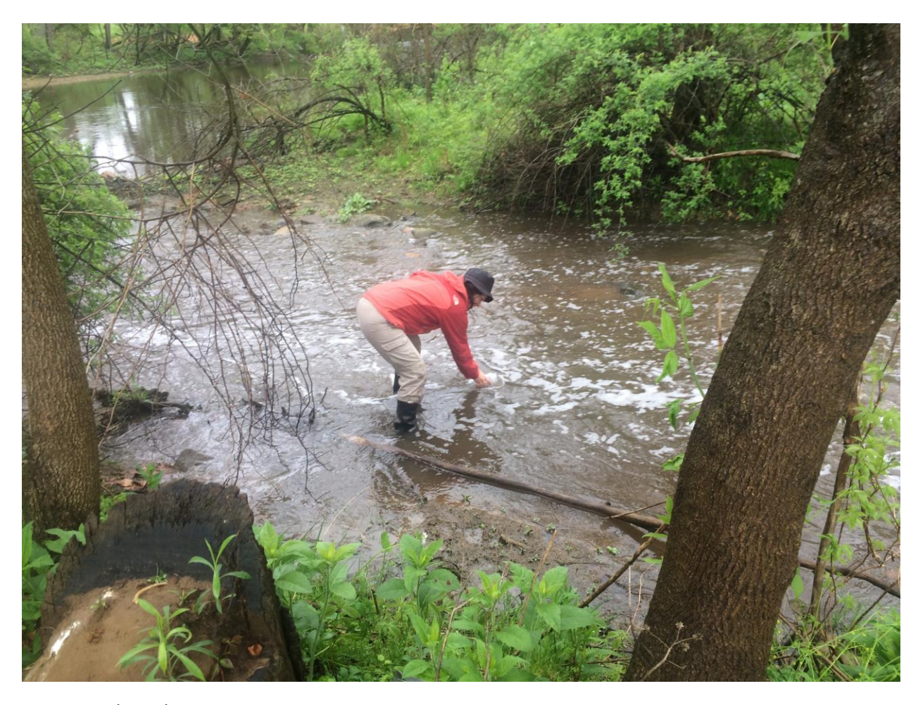
West Portal Creek